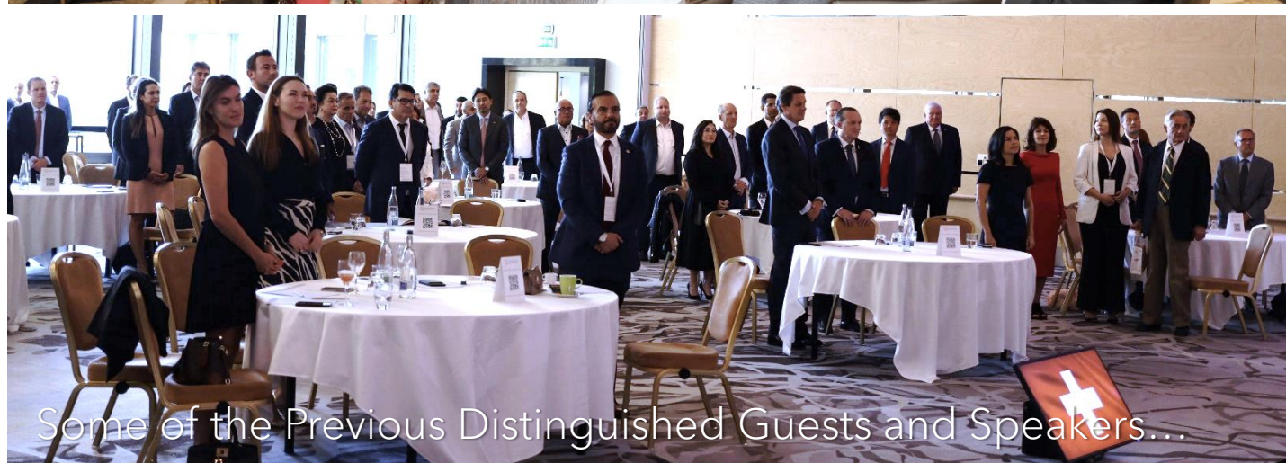
Some of the Previous Distinguished Guests and Speakers...