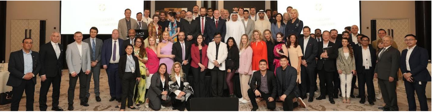
The Abrahamic Business Circle Investors Roundtable in Dubai, Palace Downtown, Dubai – March 20, 2024

The Abrahamic Business Circle is an organization of high-profile individuals across the globe that have a shared vision of tolerance, prosperity, and peace.