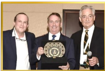
OUTSTANDING CONTRIBUTION TO ECONOMIC DIPLOMACY, 2022 The Rt Hon Liam Fox MP - Chair, UK Abraham Accords Group | Frn Secretary of State for Defence | Frn Secretary of State for International Trade | Frn Minister of Foreign & Commonwealth Office