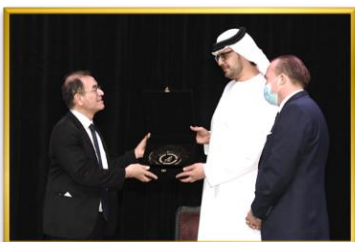
LIFETIME ACHIEVEMENT FOR ECONOMIC DIPLOMACY Nouriel Roubini - American Economist, Global Nomad Formed the Roubini Global Economic | Chairman- Roubini Macro Associate LLC