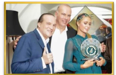
ECONOMIC DIPLOMACY AWARDS 2021 Paris Hilton & Family Represented by: Paris Hilton The Hilton family embraces the ideologies