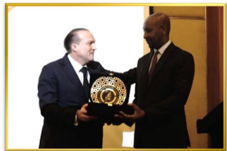
OUTSTANDING PERFORMANCE IN SOCIO- ECONOMIC DEVELOPMENT To the Government and People of the Republic of Rwanda Represented by: H.E. Edouard Bizumuremyi Minister Counsellor of the General Consulate of the Republic of Rwanda