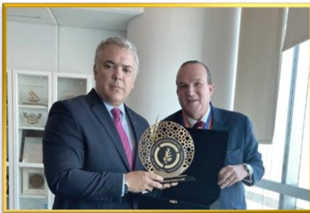
LIFETIME ACHIEVEMENT 2021 H.E. President Iván Duque Márquez President of Colombia