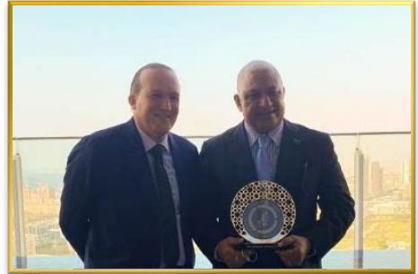
PEACE AND PROSPERITY AWARD H.E. Josaia Voreqe B. Former Prime Minister of Fiji